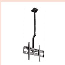
Telescopic ceiling mount CM2