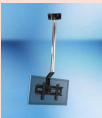
Ceiling mount CM1